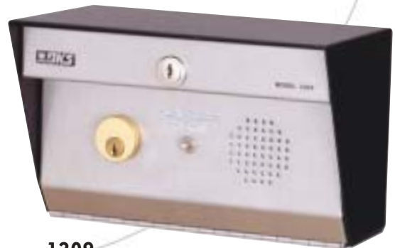
1209 Built-in Intercom Substation

These units are designed to be surface or post mounted. Each has a built in weather-protecting hood so that they can be used in indoor or outdoor applications. Simplicity and rugged design make these key switches ideal for a wide variety of applications.