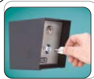
1210 access with an ace key for high level security