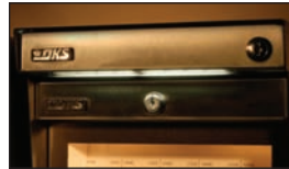
fluorescent lighting for exceptional visibility