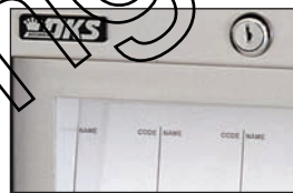
1710 directory is lighted and uses standard paper for the printed directory using your computer and printer