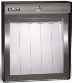
1710 surface & flush mount