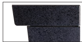
1720 light kits The 1720-080 mounts to DKS surface mount telephone entry systems and the 1710 add-on directory. The 1720-081 light kits are typically used with the 1701 and 1702 directories