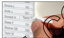
1701 & 1702 directories provide 1, 20 slots for names - 20 and 60 respectively