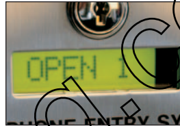
built in display indicates door gate has been opened