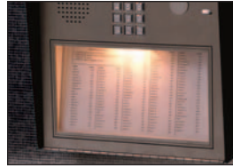
led lit directory display