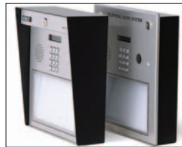
two mounts surface and flush are available