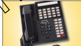
dtmf tone output allows these systems to be used with PBX, KSU and telephone systems with auto-attendants