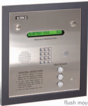
flush mount shown with trim ring - sold separately