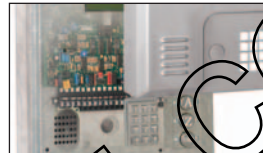
stainless steel plate and anti-vandal features protects all internal parts