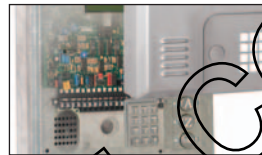
stainless steel plate and anti-tamper features protects all internal parts