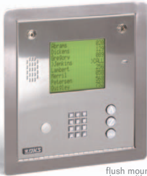
flush mount shown with trim ring - sold separately