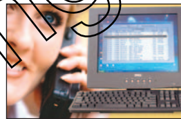
pc programmable from your PC via modem or RS-232 interface