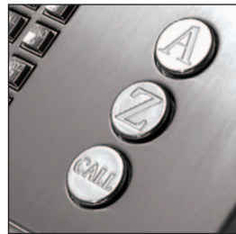
large scroll and call buttons