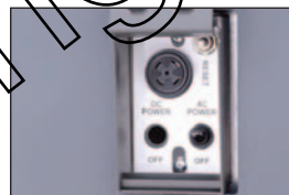
built in power and reset switches