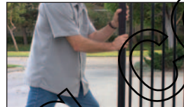
fail-safe release Never be locked out (or in) of your property