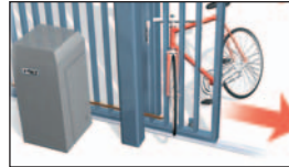
entrapment prevention system reverses gate on contact