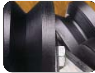
UHMW wheels for smooth quiet operation