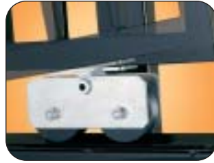
pivot point for heavy duty gates

Tandem V-Wheel assemblies are ideal for heavy gates. The pivoting bracket and tandem arrangement of the wheels allows the total weight of the gate to be evenly distributed across a larger portion of the V-track.