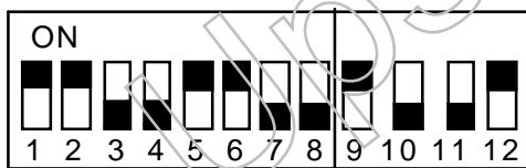
Radio Receiver #1 Left (Lower) Button On Transmitter Controls This Radio

Dip switches 9-12 Must be set as shown here in these instructions.