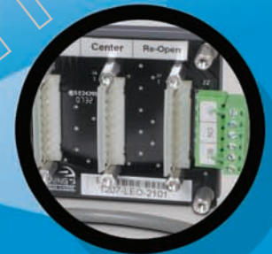
Loop rack included