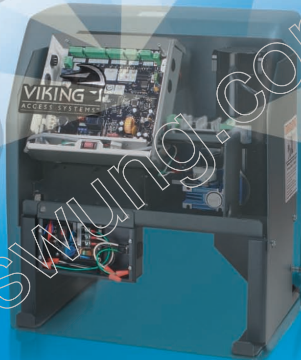
Back-drivable unit features direct drive mechanism