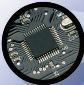
Soft-Stop / Soft-Start with intelligent Obstruction Detection