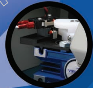
Easy access to limit switch