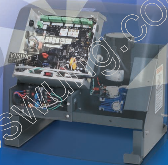
120 / 220 VAC single phase power source