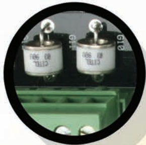
On-board lightning protection

The L-3™ gate operator has the capacity to operate slide gates up to 1200 lbs. and 40 feet in length at 100% duty cycle under extreme conditions. It's efficient mechanism provides a solution for high traffic commercial slide gate applications. The Viking L-3™ gate operator offers efficiency and technology combined in a single package. This operator is UL Listed 18TC UL325 and UL991.