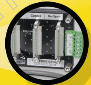
Loop rack included