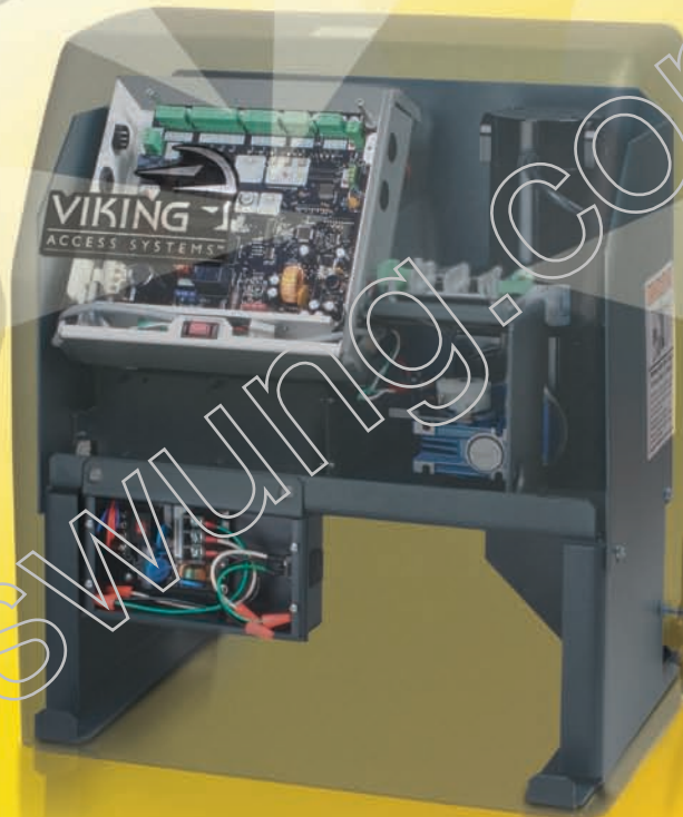
Built in optional auto-open feature in case of power failure