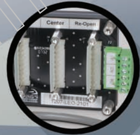
Standard loop rack