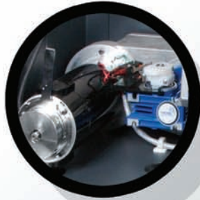
Powerful and efficient gear head motor

The Q-4™ incorporates a powerful and efficient DC motor, a high ampacity power supply, an integrated battery back-up system and intelligent controller. The incorporation of these features results in outstanding performance on heavy duty slide gates. The advanced motor control circuit driving the motor guarantees long life. The Q-4™ brings the advantages of DC gate operators into heavy duty applications. This operator is UL Listed 18TC UL325 and UL991.