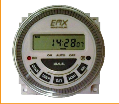
ETM-17 Digital Timer