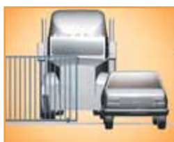
adjustable partial open for different opening distances