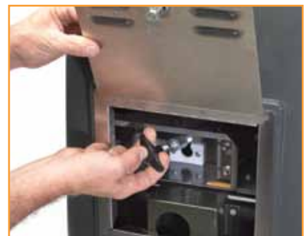
easy to use "T-Handle" release