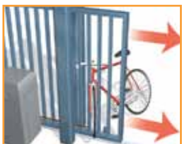
entrapment detection reverses gate when obstructed