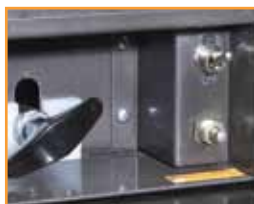
built in power switch and reset switch