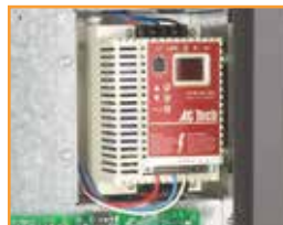
variable speed motor drive