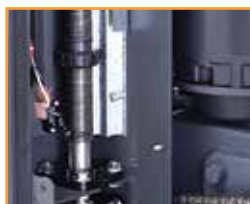
limit switches direct driven and easily adjustable