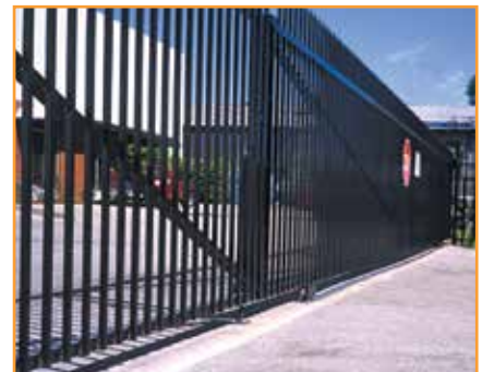
large gates up to 2000 Lbs