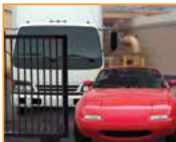
partial open open gate short distance for cars or open fully for trucks